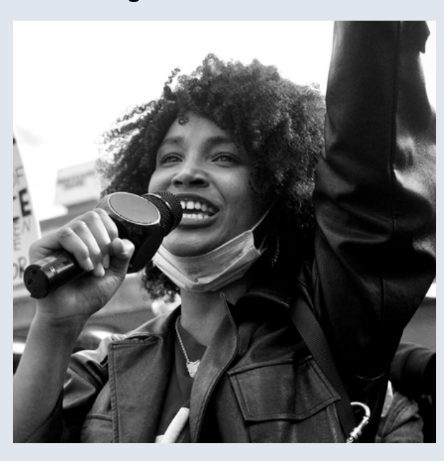
Click on the image to download.