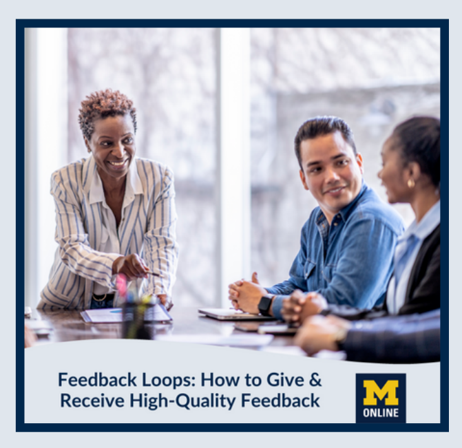
Click on the image to download.