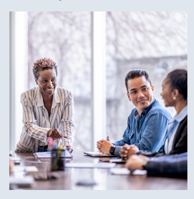
Click on the image to download.