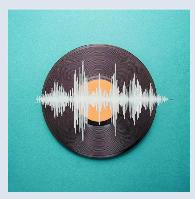
Click on the image to download.